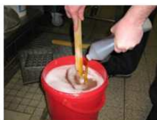
Adler Bio- und Wassertechnik

Biological pipe cleaning can be used both as a preventive measure in new pipelines and for pipe cleansing in older pipelines.