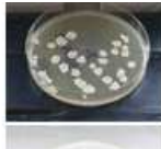
« Colonies of Bacillus on an Agar plate